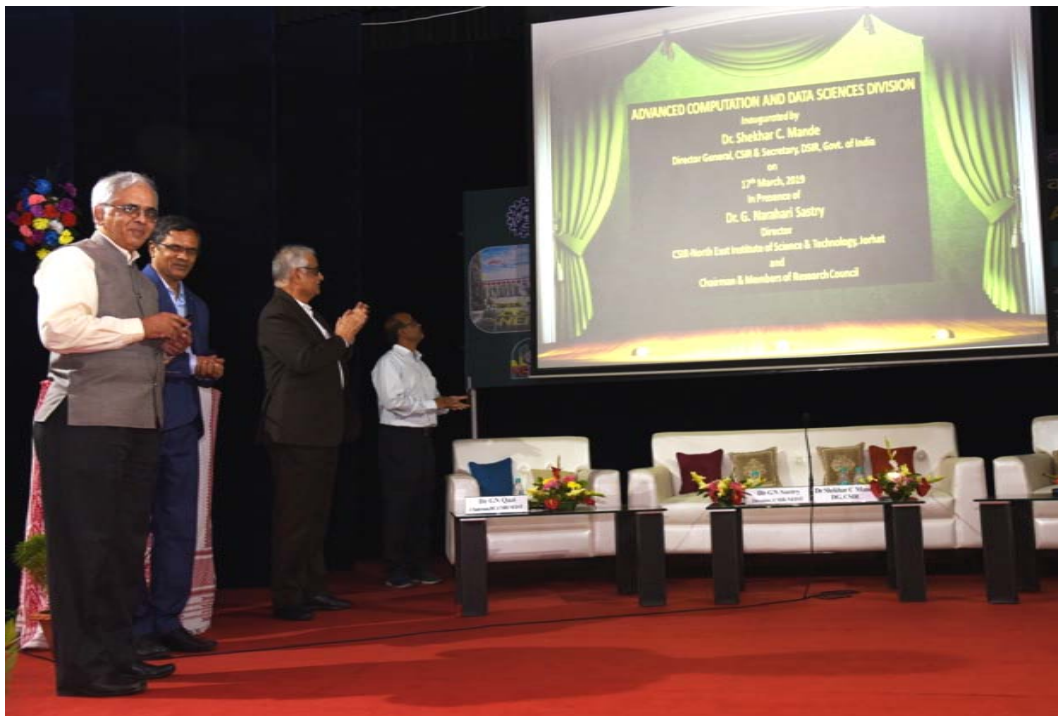
Online inauguration of Advanced Computation and Data Sciences Division by Hon'ble Chief Guest, Dr Shekhar C Mande in presence of the dignitaries