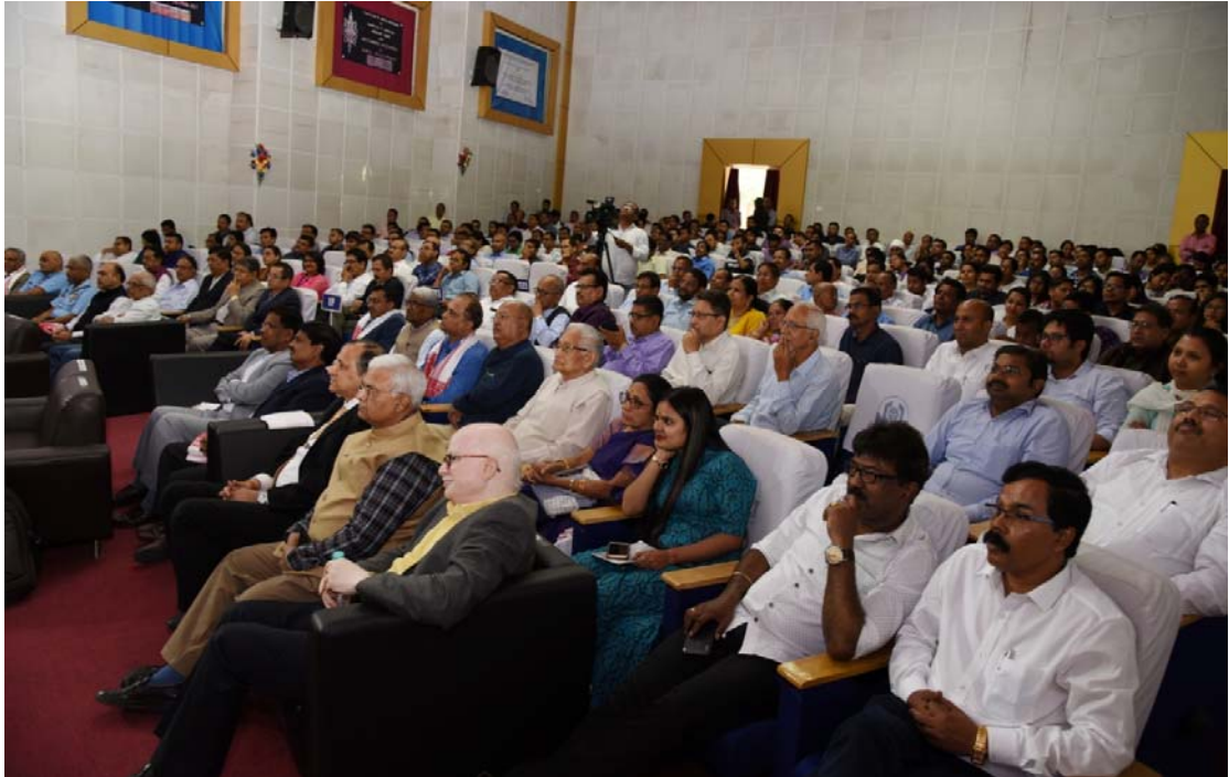
A section of audience attending the Foundation Day celebration programme