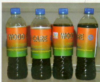
Wood care Formulation developed by CSIR-NEIST

A potential formulation to prevent damage in wood and bamboo has been developed by CSIR-NEIST. One of the major causes for degradation of wood and bamboo products is due to fungal and