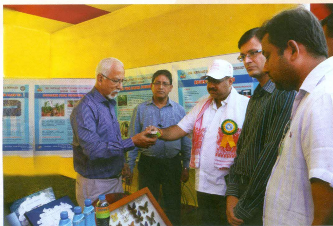
Shri Basanta Das, Hon'ble Minister of State (Ind) Deptt. of Fisheries, Printing & Statioery, Govt of Assam, (3rd from left) Shri Vishal Basanth Solanki, IAS, Deputy Commissioner, Jorhat (2nd from right) visited CSIR-NEIST exhibition stall.

CSIR-NEIST participated in the exhibition held on the occasion of State Level National Children's Science Congress held during 29-31 October, 2015 at Jawahar Navodaya Vidyalaya, Titabar (Assam). CSIR-NEIST showcased and disseminated its various technologies through product samples, numbers of medicinal plants pots, posters, banners and exhibit materials. The event