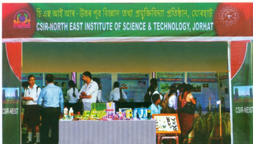
Students and Teachers of Childrens Science Congress visited CSIR-NEIST exhibition stall of CSIR-NEIST at Jawahar Novodaya Vidyalaya, Titabor.