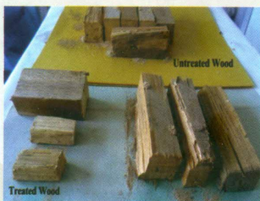
Tested wood samples in lab with the formulation.