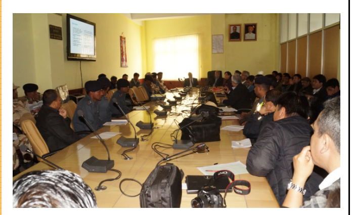
Debriefing of Disaster Management plan.

CSIR-NEIST organized Multi-State Mega Mock Exercise for Preparedness on Repeat of M 8.7 Shillong Earthquake