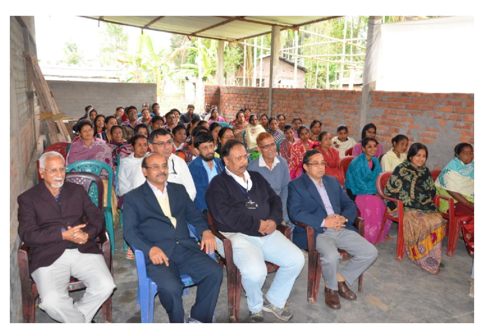
A section of Beneficiaries along with CSIR-NEIST staff attending the Beneficiaries Meet.