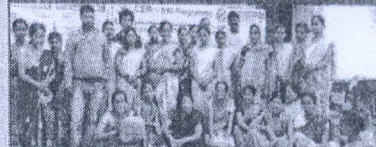
Training on Vermicompost production, Banana fibre extraction, aromatic plants cultivation, Mushroom cultivation and other MSME technologies for socio-economic development

Services : CSIR-NEIST also offers various testing & analysis services to govt. agencies, private enterprises, and other user agencies, the details of which are available at www.neist.res.in .