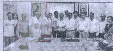
Technology Transfer of Herbal Anti-Marks and Anti-Fungal formulations