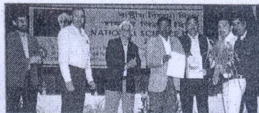
Technology Transfer of Improved variety of Citronella (Jor Lab C-5)