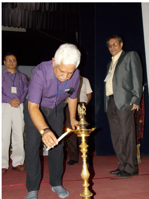
Caption of the photo 1.: The lighting of the lamp in the the inaugural programme of 8 th Mid-Year CRSI National Symposium in Chemistry at CSIR-NEIST, Jorhat on 10 th July 2014.