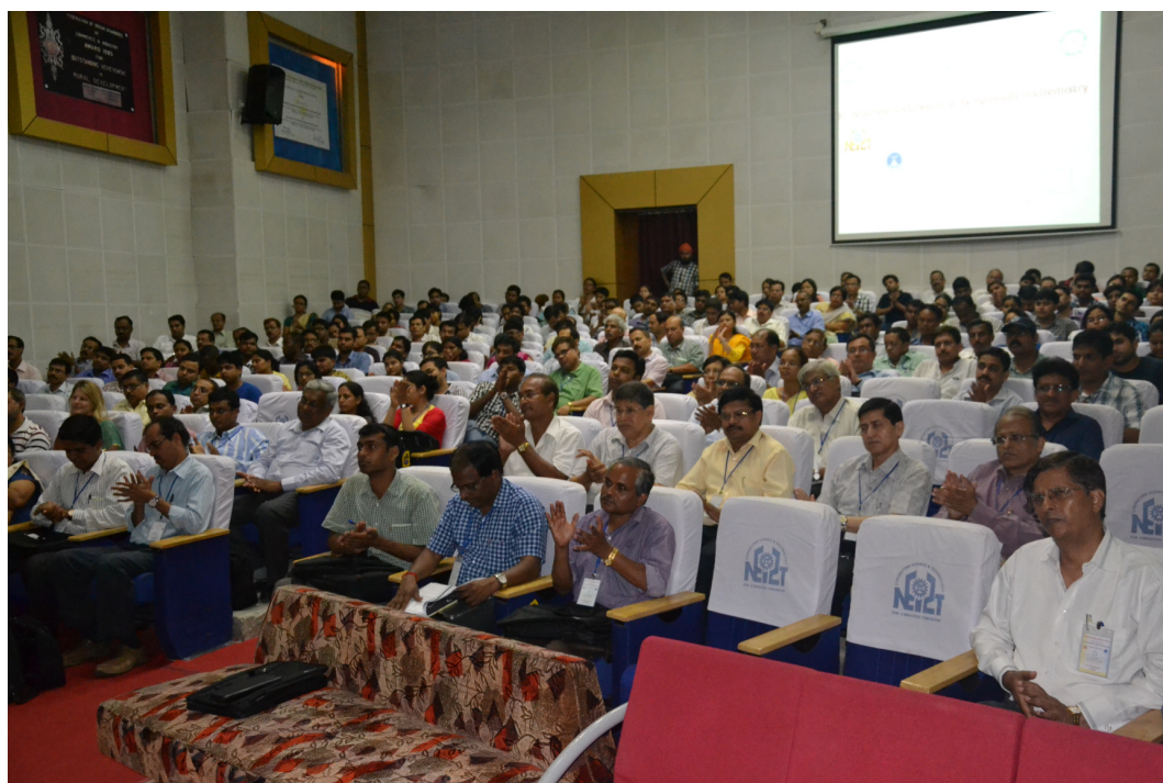
Caption of the photo 4.: Participants attending inaugural programme of 8 th Mid-Year Chemical Research Society of India (CRSI) on 10 th July 2014 afternoon at Dr JN Baruah Auditorium at CSIR-NEIST, Jorhat.