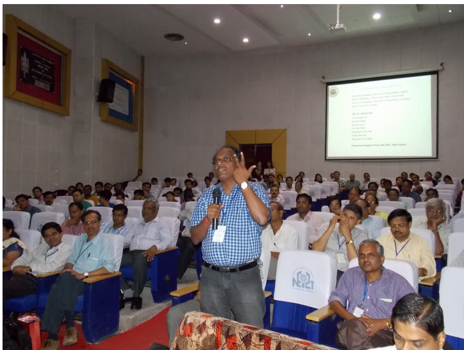
Caption of the photo 6.: Participants interacting with the speaker in the symposium at Dr JN Baruah Auditorium at CSIR-NEIST, Jorhat.